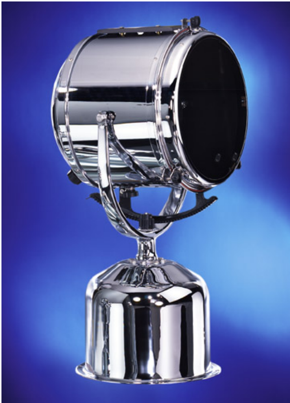
Chrome Finish seen above