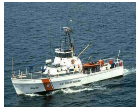
Used widely throughout the U.S. Coast Guard!

This searchlight family is used widely throughout the U.S. Navy, U.S. Coast Guard and worldwide for Commercial Marine and Security Applications. It is a rugged, high quality Brass and Stainless Fixture, with a powerful Beam which will project from 1 to over 2KM, depending upon the fixture selected. The beam will immediately stop when the target is sighted, with built-in electric braking. The rotation is beyond a full circle (385°) with a unique sliding stop design. The anti-condensation heater will increase the life of the electrical parts in the base.