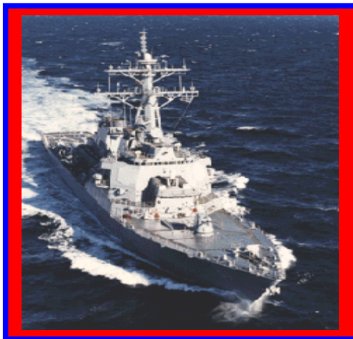
The USS John McCain "Guided Missile Destroyer"