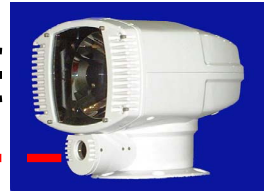
Streamlined Model seen above!

Night Vision Camera detects danger covertly, and because the searchlight is aimed at the same target as camera... the operator throws the switch, and provides instant Non-lethal Deterrence!